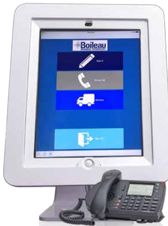
Phone directory used for unattended reception